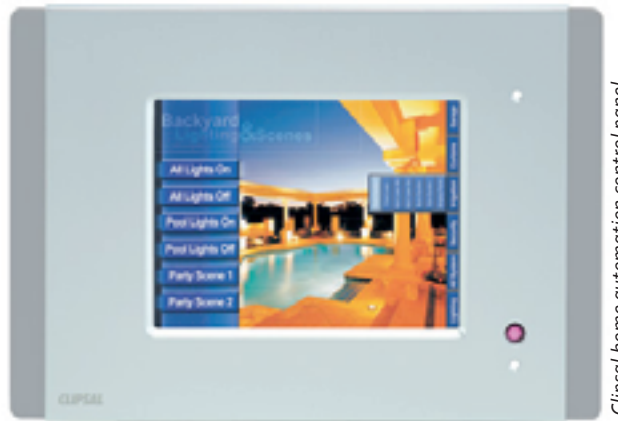
Clipsal home automation control panel

Enhance your lifestyle with smart home automation. Integrate all the electrical devices in your house with each other and telecontrol them conveniently and securely from the control panel, a personal computer or even over the internet. Home automation can also improve the quality of life for persons who might otherwise require caregivers or institutional care.